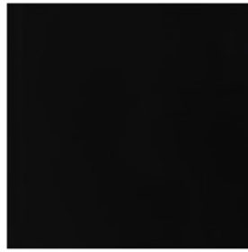
Black Lacquer (BQ)