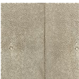
Mist Shagreen (MT)