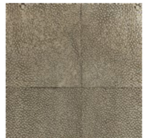
Fog Shagreen (FX)