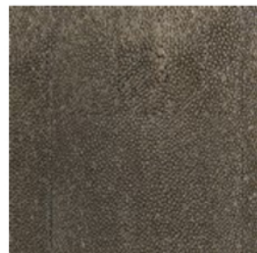
Charcoal Shagreen (HA)