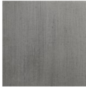
Modern Steel (MO)