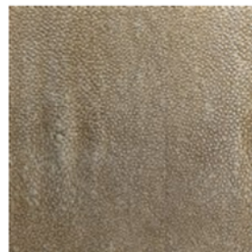
Dew Shagreen (DD)