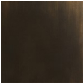
Aged Bronze (AZ)