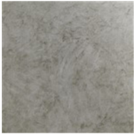
French Metal (FE)