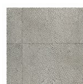
Silverlake Shagreen (SK)