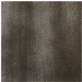
Rivera Steel (RS)